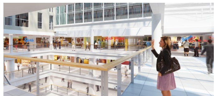
A skylight brings natural light into all five of the new shopping centre's floors. The skylight is already in place, but construction site barriers are yet covering it and keeping it hidden from view.

tinuous planning of work sites, pedestrians' passageways and protection, explains Jouko Pelkonen , a construction manager from Sponda.