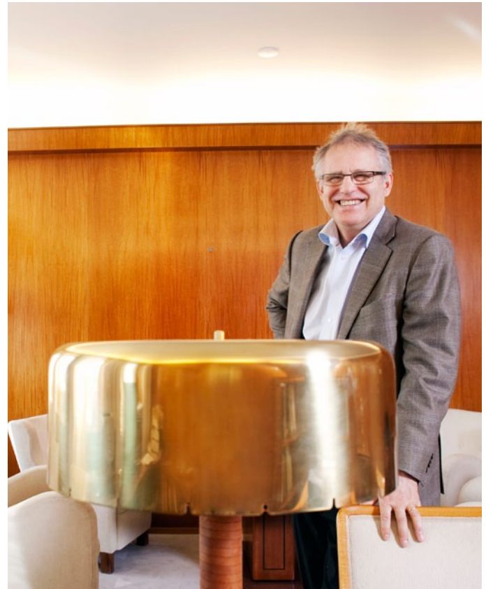
Mikko Könkkölä, President of the Helsinki Court of Appeal, is satisfied with the functioning of the new premises of the court of appeal and its dignified atmosphere.

In the new facilities, all courtrooms are located on the same floor. Therefore security checks can be conducted centrally at the entrance. Having the district court and appeal court in the same building brings also synergy benefits to Salmisaari: document traffic, prosecutors' jobs and the transporting of prisoners have all been facilitated.